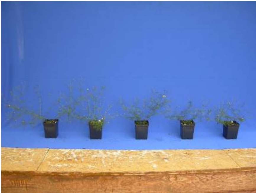
Concise @ 0, 15, 30, 45, 60