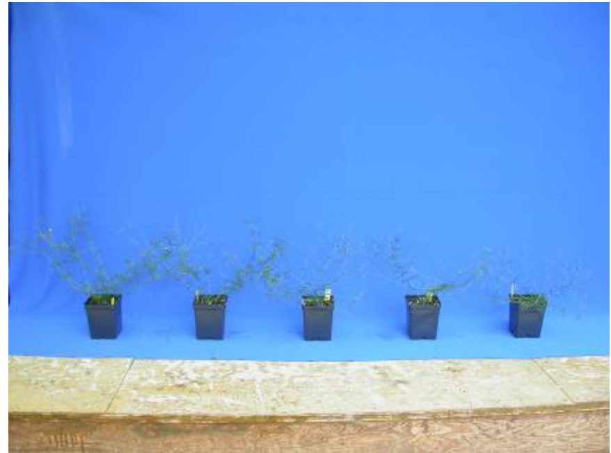
Sumagic @ 0, 15, 30, 45, 60