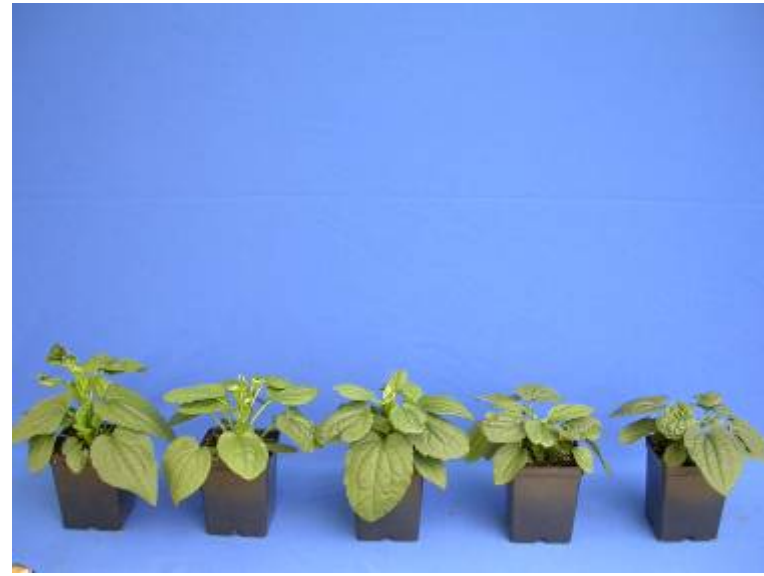
Sumagic @ 0, 15, 30, 45, 60