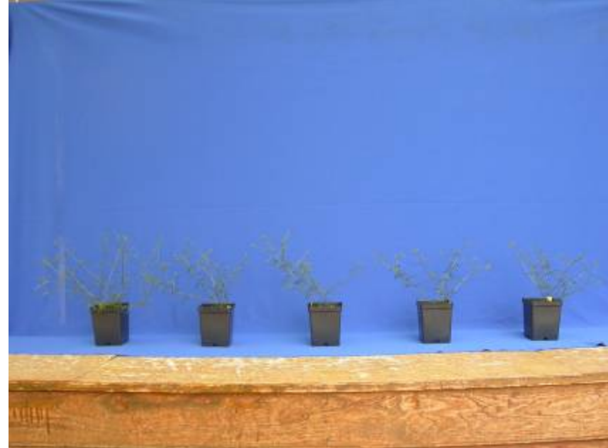
Sumagic @ 0, 15, 30, 45, 60