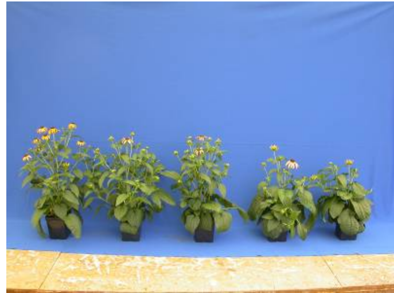
Sumagic @ 0, 15, 30, 45, 60