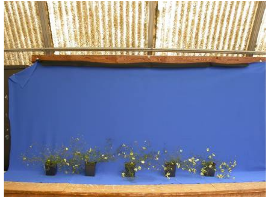
Sumagic @ 0, 15, 30, 45, 60