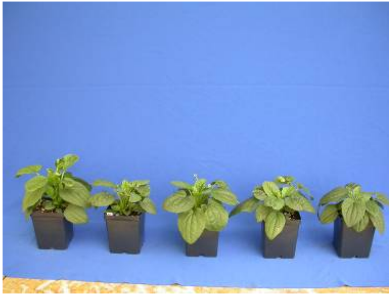
Concise @ 0, 15, 30, 45, 60