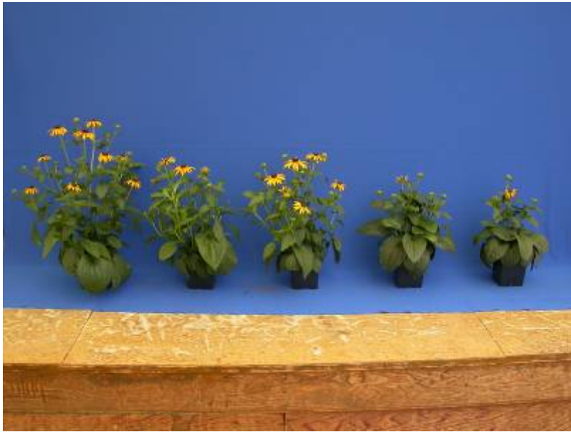
Concise @ 0, 15, 30, 45, 60