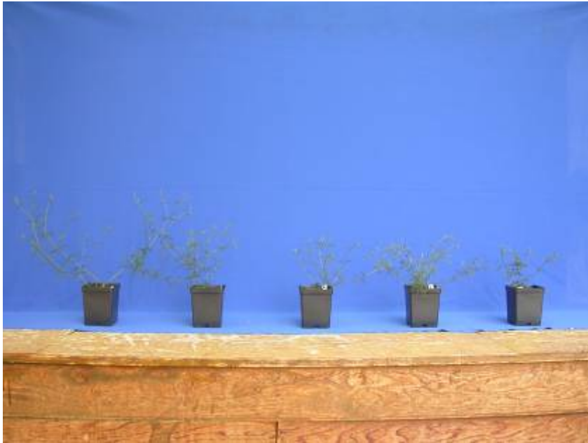
Concise @ 0, 15, 30, 45, 60