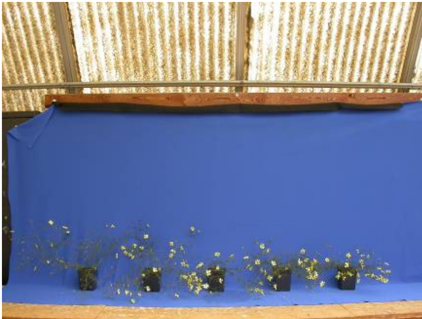
Concise @ 0, 15, 30, 45, 60