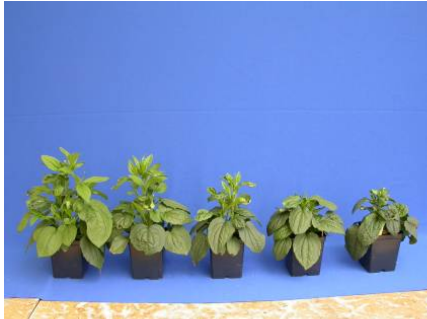
Sumagic @ 0, 15, 30, 45, 60