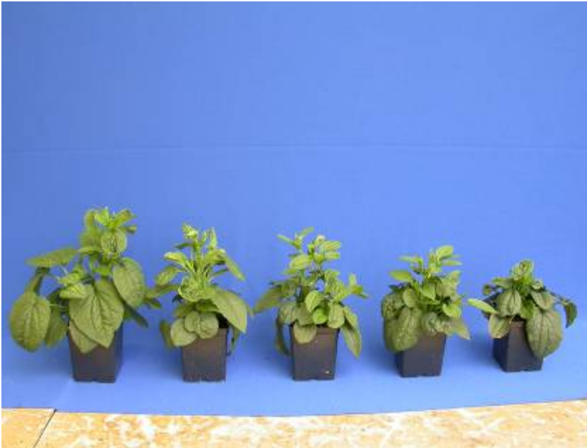
Concise @ 0, 15, 30, 45, 60